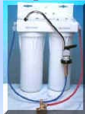
Point of Use